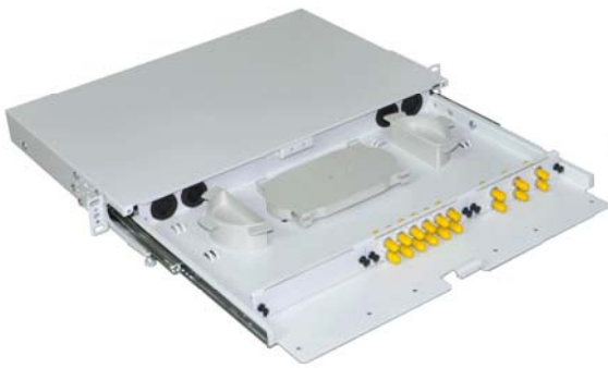
Open Slide out